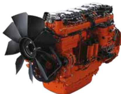
DOC + DPF